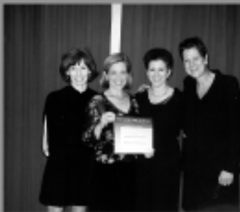
Producers accept "Finalist Award " in Guidance & Counseling 1999